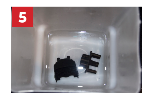
Separate both pieces of the brew head and place into the solution. Allow to soak for at least 1 hour

*Use one (1) Egro Milk System Cleaning Tablet.