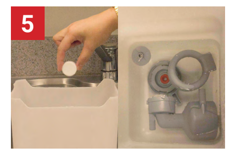
Dissolve an Egro Milk System Cleaning Tablet in a container with warm water. Place pieces of the mixer unit into the solution. Allow to soak for at least 1 hour.