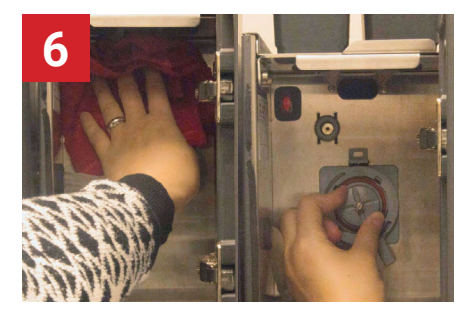
Wipe the powder module with a clean damp towel. Remount the knob and the ring back into the powder module pushing firmly until it clicks.